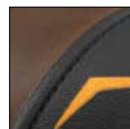
RTC with countersunk seams