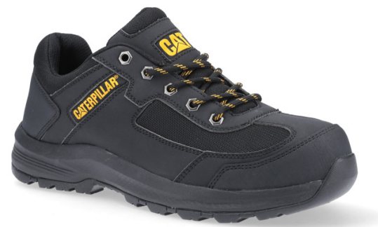
BLACK P725317 Microfibre & Mesh