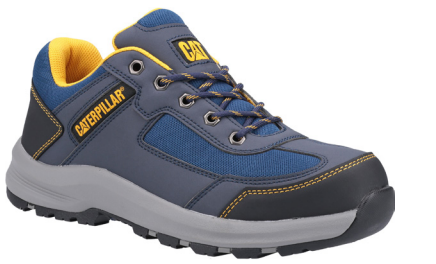
BLUE P725099 Microfibre & Mesh