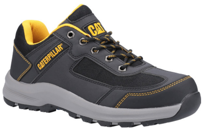
GREY P725100 Microfibre & Mesh